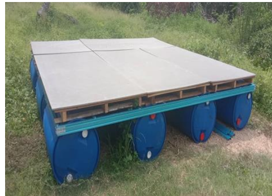
Rafts to reduce loss of electrical appliances

Despite these preparations, global warming and climate change resulted in unprecedented rainfall.