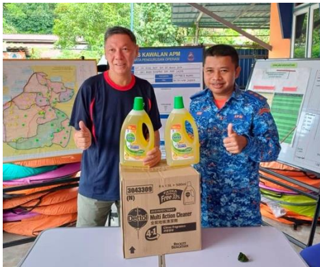
Distributing disinfectants to Angkatan Pertahanan Awam Malaysia

Working with government agencies and local NGOs, we stocked their evacuation centres with disinfectants to reduce infections due to overcrowding. Villagers assembled thirty-four 12 by 12-foot rafts and placed them in vulnerable areas prone to inundation.